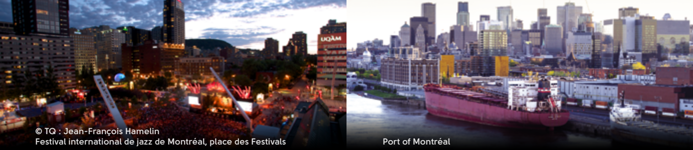
Festival international de jazz de Montréal, place des Festivals