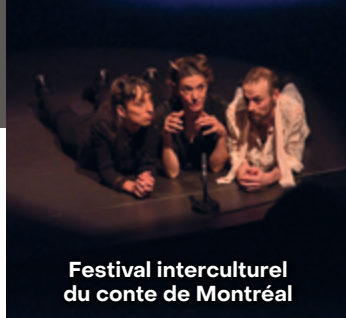
Festival interculturel du conte de Montréal