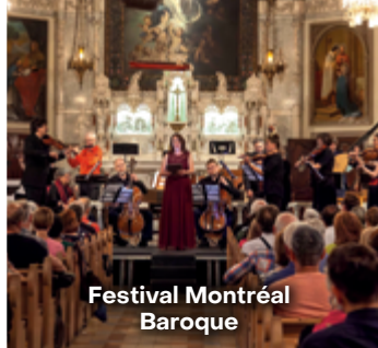
Festival Montréal Baroque