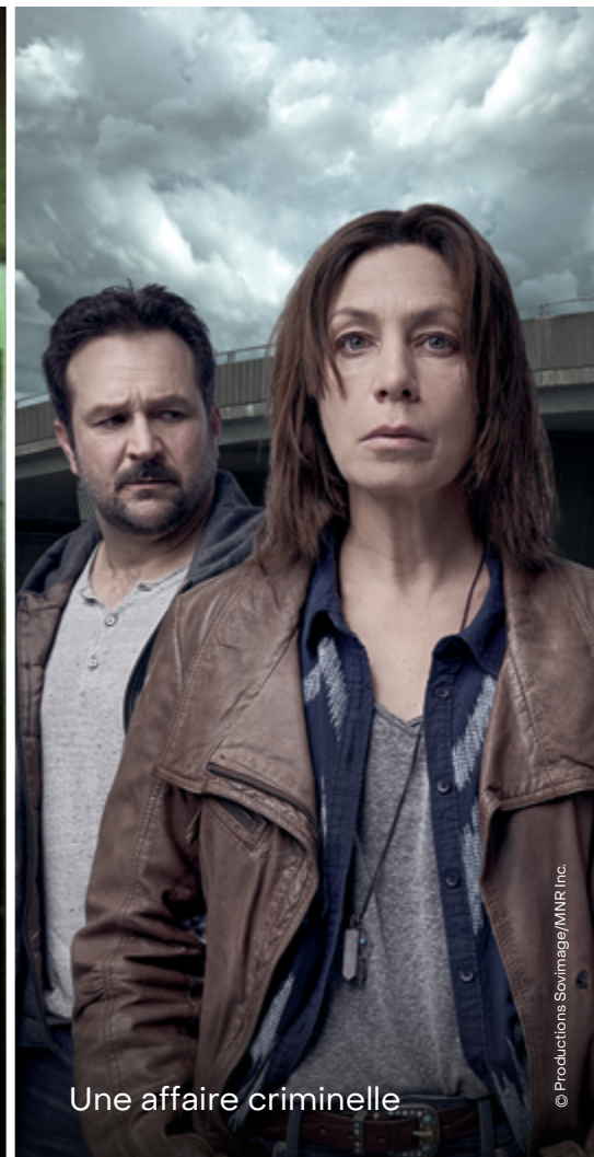
Une affaire criminelle