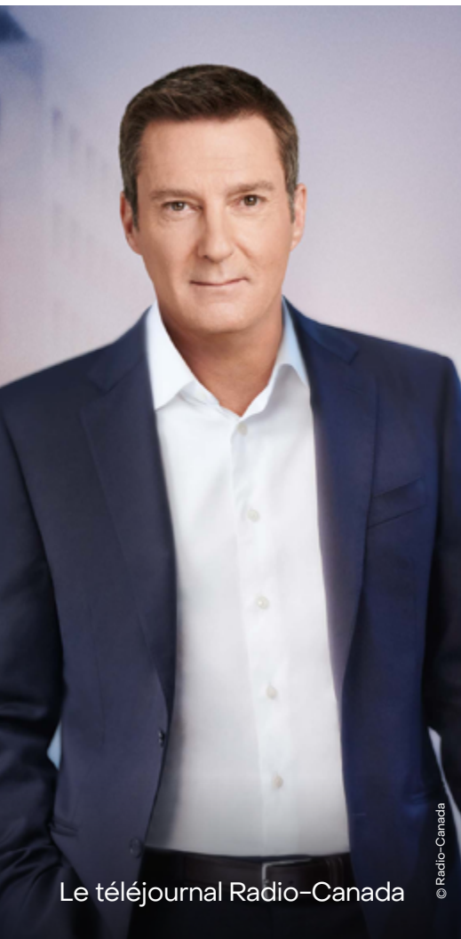
Le téléjournal Radio-Canada