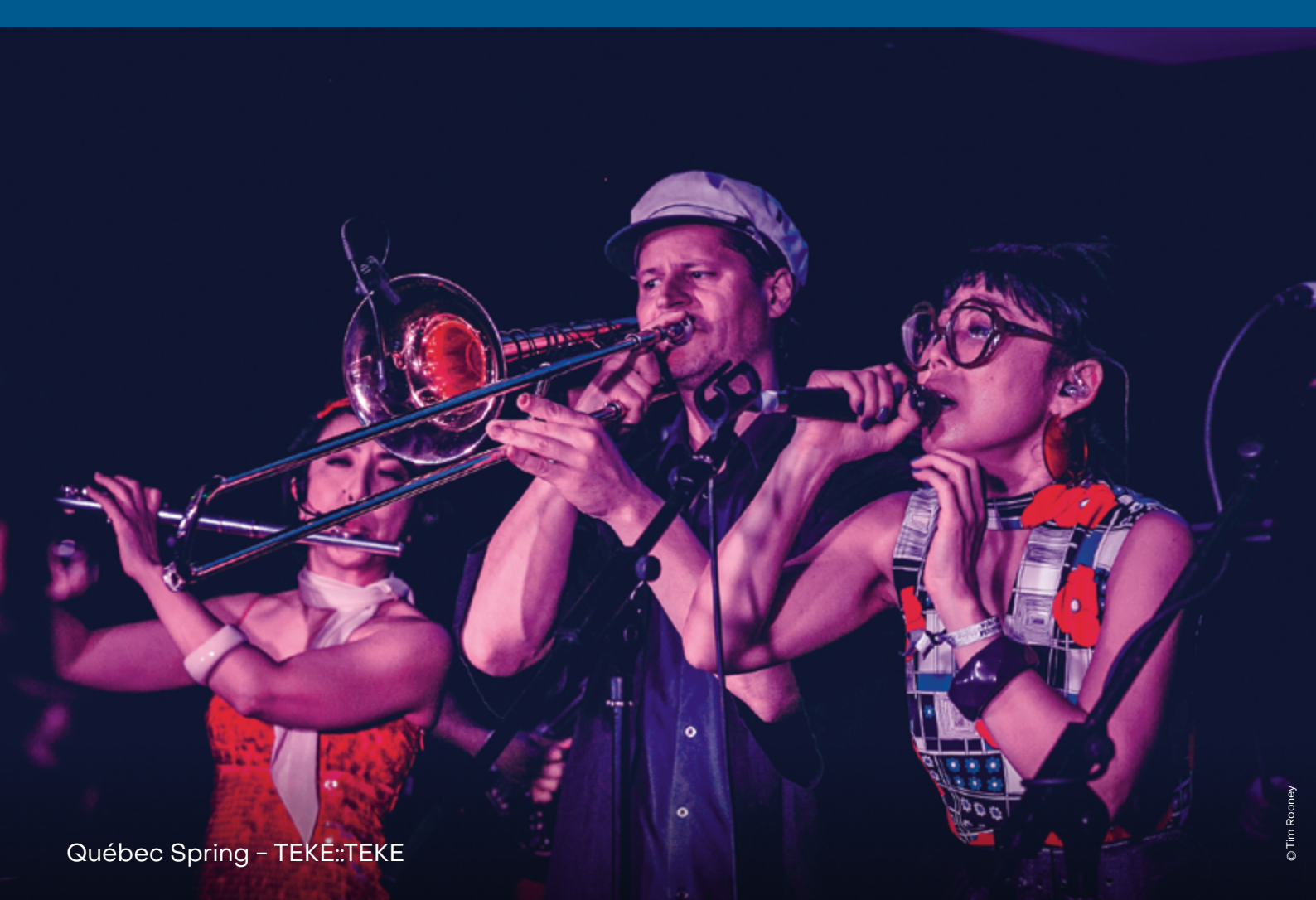
Québec Spring - TEKÉ::TEKE