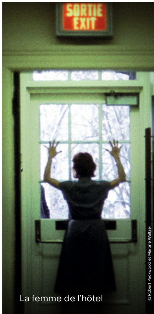
La femme de l'hôtel