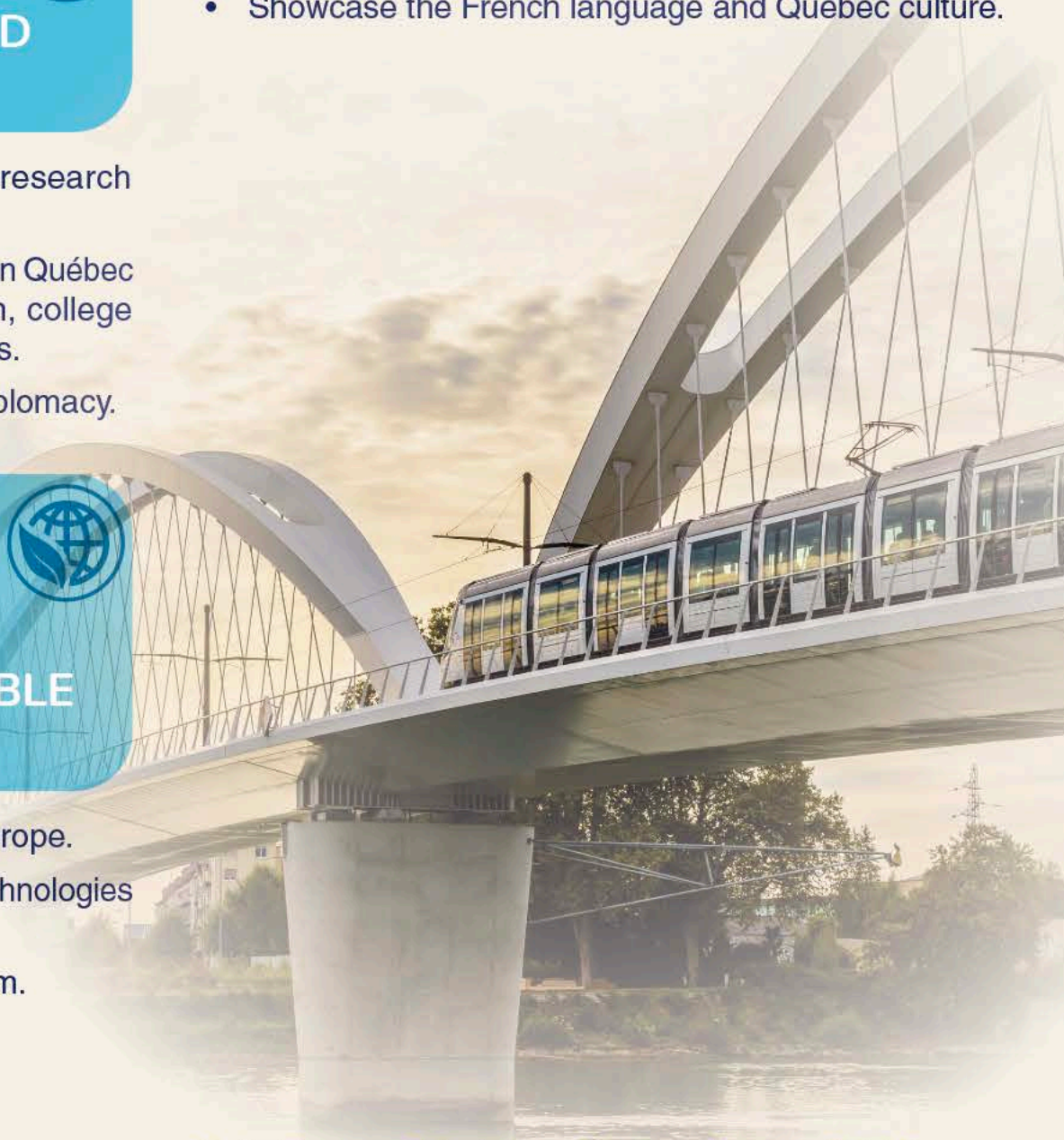
Beatus Rhenanus Bridge between Strasbourg, France and Kehl, Germany.